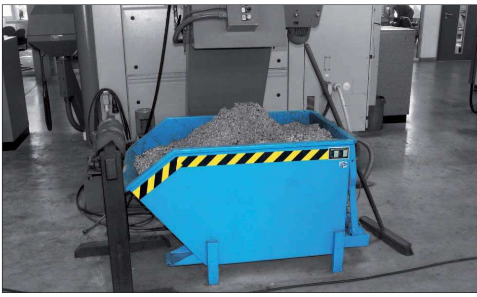
Type SGU with supporting feet for use with a pallet truck