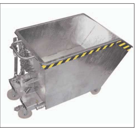
Type SGU in emptying position