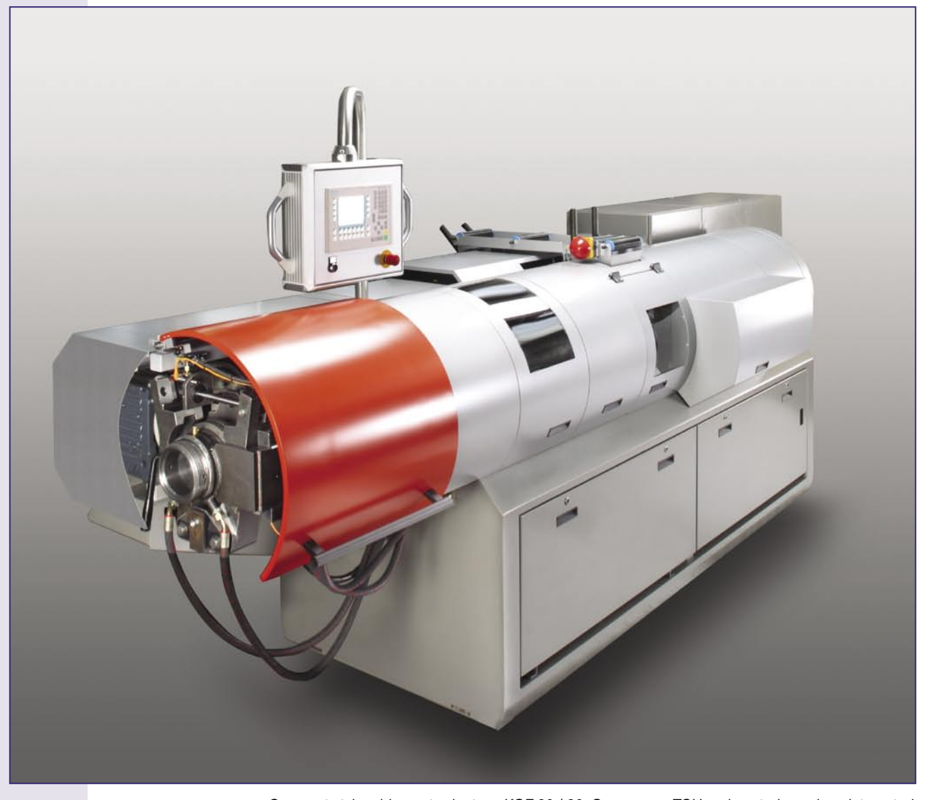
Compact style rubber extruder type KGE 90 / 20. Gear pump, TCU and control panel are integrated.

With our extruder your production of profiles and hoses can be optimized. Specially when you often have to change the profile to be produced, our compact style extruder gives you the best benefit.