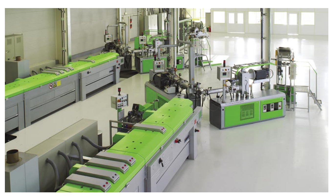
Extrusion line for the production of profiles for the automotive industry