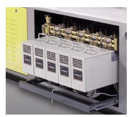
TCUs slide out for easy servicing