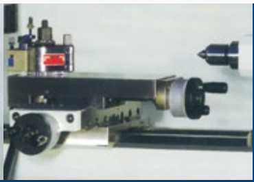
Cross support with crank and swivelmounted upper slide; swiveling range \pm 40^{\circ}