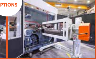
Continuous spirals knives cutting heads