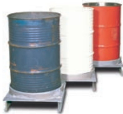
Standard drums can be used for storage and transport of the hazardous waste. By using several drums, sorting is possible.

Operator easily handles the heavy duty steel pallet with standard pallet lifter.