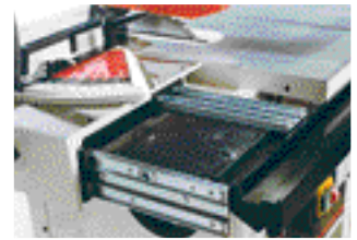
Sturdy cast iron sliding table with linear guide and adjustment screws for easy, accurate set-up.