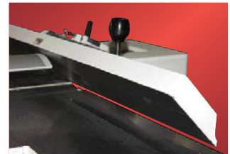
Jointing fence tilts \pm 45^\circ – for maximum protection, also when cutting chamfers